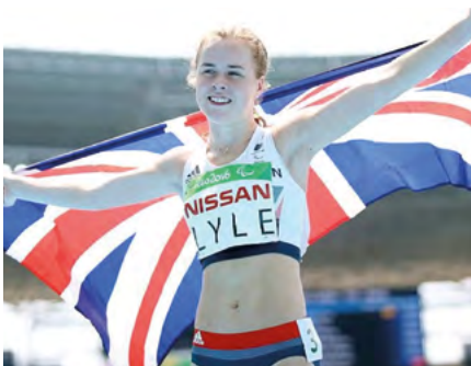
Maria Lyle Paralympics Medallist

I love being active and have done since I was little. Being able to run around always made me happy.